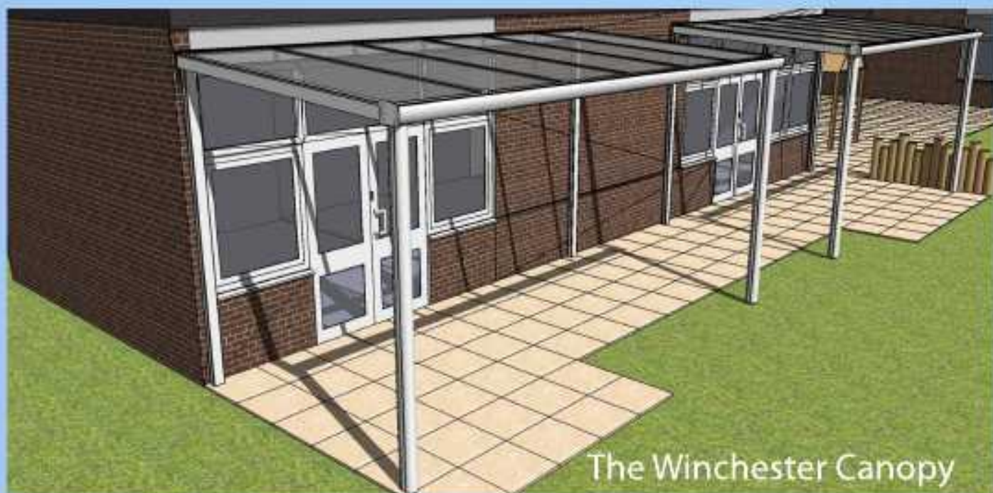
The Winchester Canopy